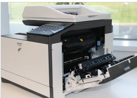
Convenient access to paper path from side panel door makes it easy to clear misfeeds.