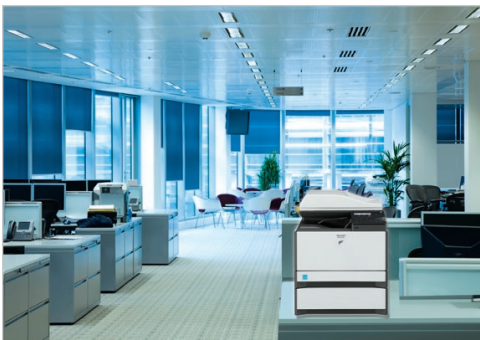
Compact yet powerful enough for workgroup environments.