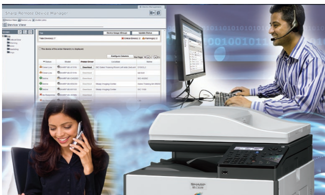
Sharp Remote Device Manager.