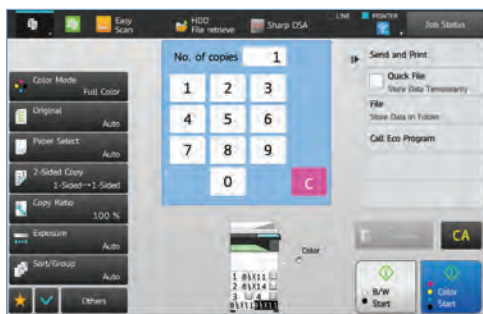
Standard Copy Screen offers more advanced features.