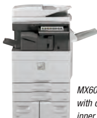
MX6070N shown with compact inner finisher.

When it's time to get the job done, the Advanced Series colour document systems are outstanding performers. Quickly scan documents at speeds up to 200 images per minute . Built-in optical character recognition (OCR) can convert your scanned documents into text-searchable PDFs or Microsoft Office file formats, simplifying your workflow. Use the manual stapling feature on select finishers to restaple your originals. Multiple finishing options give you the output you require, be it stacked, stapled or saddle-stitched. There's even an available built-in stapleless staple feature, which can bind up to five sheets of paper by adding a crimp to the corner of the set, saving regular staples for larger sets.