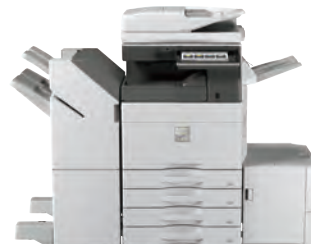
MX6070N shown with 3K saddle stitch finisher and large capacity cassette.