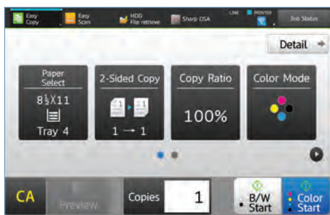
Easy Copy Screen offers the most commonly used settings.