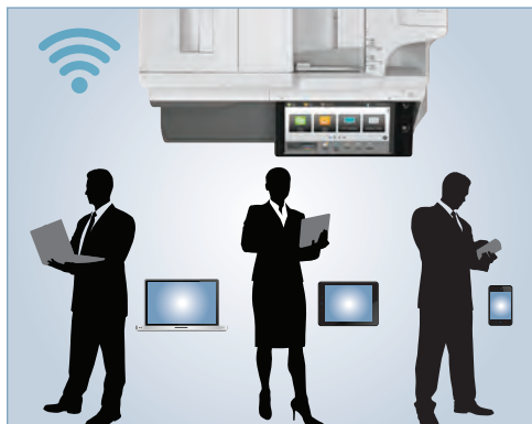
Built-in wireless network interface for convenient scanning and printing from mobile devices.

From paper handling to networking, the MX5070N and MX6070N colour Advanced Series will exceed your expectations.