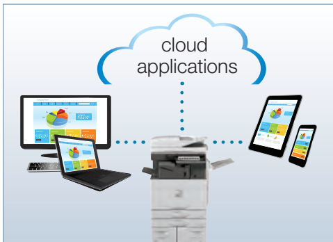
Distribute, access and print documents more easily.