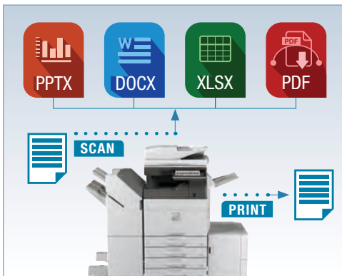
Scan and convert documents to popular file formats seamlessly with Sharp's built-in OCR function.