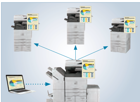
With Serverless Print Release technology you can securely print a job and release it from any of six colour Advanced Series models.