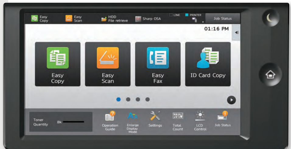
7" colour touchscreen (diagonally measured).