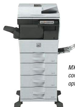
MXB455W shown with compact inner finisher and optional paper trays.

When it’s time to get the job done, the MXB355W/B455W are outstanding performers. Quickly scan documents at speeds up-to 110 images per minute (MXB455W). Built-in Optical Character Recognition (OCR) can convert your scanned documents into text-searchable PDFs or Microsoft Office file formats, simplifying your workflow. An available compact inner finisher with three position stapling can give your documents a professional look.