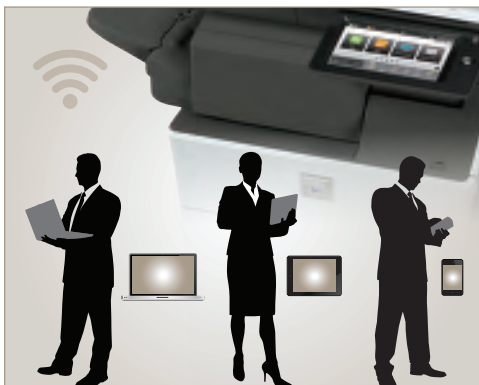
Built-in wireless network interface for convenient scanning and printing from mobile devices.

From paper handling to networking, the MXB355W and MXB455W Advanced Series desktop monochrome document systems will exceed your expectations.