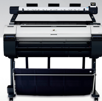
iPF770 MFP L36ei