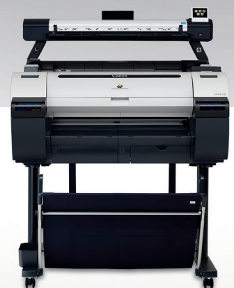
iPF670 MFP L24ei