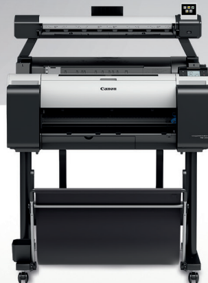
TM-200 MFP L24ei