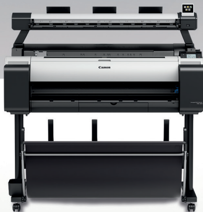
TM-300 MFP L36ei

Free Layout Plus: New! Nest, tile, and create custom layouts before printing your files with this print utility. Use the Plug-in feature to print directly from Microsoft® Office programs. Compatible with the TM-300 and TM-200 models only.